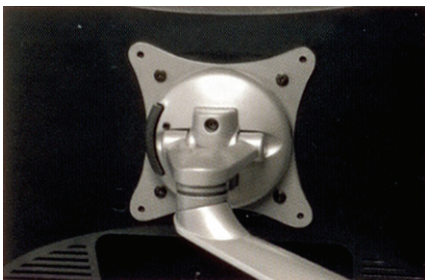
release catch shut